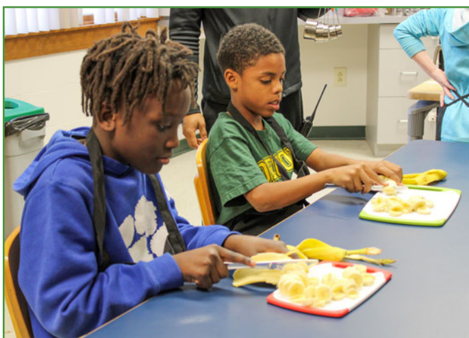
Students prepare bananas for a recipe in the new Family and Consumer Science course.